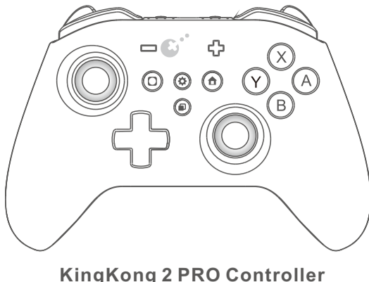
KingKong 2 PRO Controller